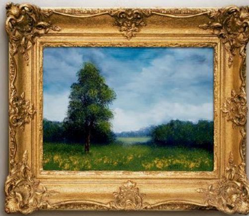
"THE OTHER FIELD" EDWARD HOPPER 1966

IT'S NOT ABOUT BEING THERE. IT'S ABOUT BEING AWARE.