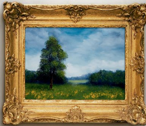
"THE OTHER FIELD" EDWARD HOPPER 1966

IT'S NOT ABOUT BEING THERE. IT'S ABOUT BEING AWARE.