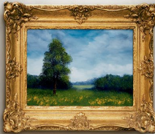
"THE OTHER FIELD" EDWARD HOPPER 1966

IT'S NOT ABOUT BEING THERE. IT'S ABOUT BEING AWARE.