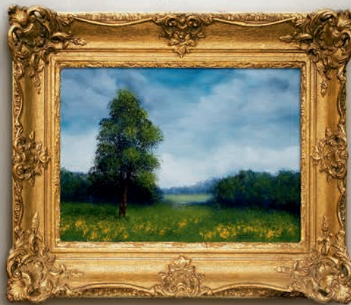
"THE OTHER FIELD" ZABO TOROQUE

IT'S NOT ABOUT BEING THERE. IT'S ABOUT BEING AWARE.