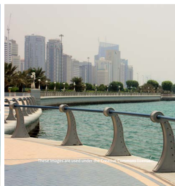
These images are used under the Creative Commons license.